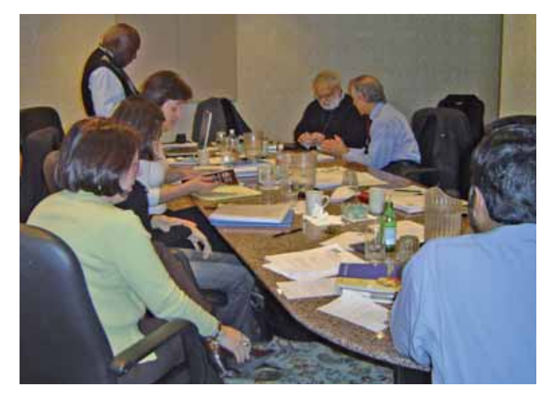
Second Meeting of IAU Task Force on Access to Higher Education, Washington D.C, USA

rent policy priorities and approaches and allow for the sharing of lessons and good practices in the pursuit of equity in higher education, especially for under-represented groups. As policies, at least rhetorically, seek to level the playing field, the Task Force hoped to examine how various institutions and governments address questions as to who gets into higher education, under what conditions, into which institution or program, at what level and for what purpose.