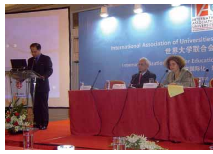
IAU International Conference, Beijing, China

Unfortunately this effort showed that even fewer institutions and