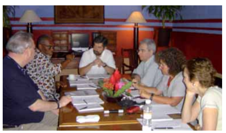
Meeting of the IAU Task Force on Fundraising, Merida, Mexico

In terms of projects, the Task force concluded that all IAU activities should be considered as potential sources for project development. This potential for future projects should guide IAU decision-making whenever new themes are being considered. All agreed, that elaborating a useful membership project that could either raise revenue or at least be self-financed, would be the logical next step for the Task Force on Access to Higher Education, once the Policy statement on this topic is adopted by the General Conference in 2008.