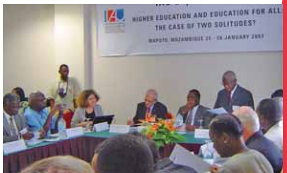
IAU Experts' Seminar, Maputo, Mozambique

• its first aim is to improve and increase information sharing and awareness raising - among both HEIs and other stakeholders - concerning EFA related